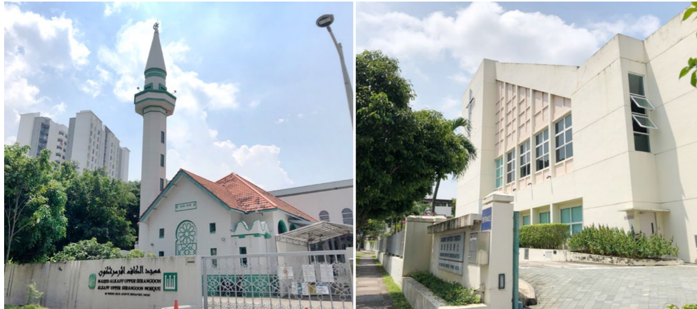
There are places of worship in Sennett Estate such as Alkaff Upper Serangoon Mosque on Pheng Geck Avenue (left) and Calvary Baptist Church on Wan Tho Avenue (right).

After this scheme, there were no more news reports about flooding in Sennett Estate. While flash floods still occasionally plague the area, they are no longer as severe thanks to the flood control measures in place.