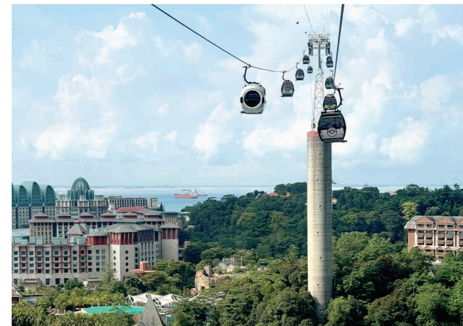
Cable cars along the Mount Faber Line linking Mount Faber and Sentosa, 2024. Seen here are the new SkyOrb cabins and other cars dressed in the Pokémon motif.

Over the last five decades, Sentosa's cable cars have established themselves as a familiar landmark to those who pass along Telok Blangah Road. Yet despite the familiarity, it is still a major draw, offering as it does, a unique perspective of the harbour and Singapore's coastline. The service's commitment to constant upgrading and improvement will undoubtedly enable these cable cars to continue soaring. ♦