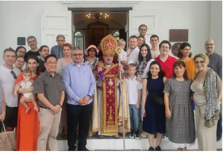
rchbishop Haigazoun Najarian, with the Ambassador of Armenia to Singapore Serob Bejanyan beside im, and congregants at the Armenian Apostolic Church of St Gregory the Illuminator, 9 June 2024.

were also Armenians from Armenia, especially after the dissolution of the Soviet Union in 1991. (Armenia had come under Soviet domination after World War II.)