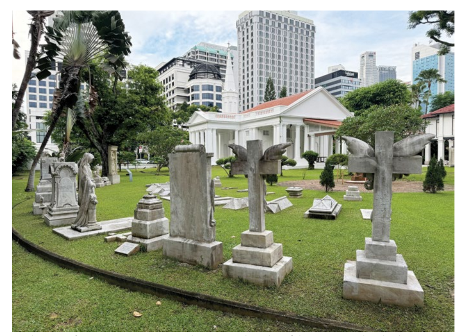
Tombstones of prominent Armenians in the Memorial Garden of the Armenian Church. The parsonage is located on the right.