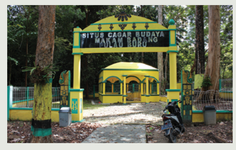
The grave believed to belong to Badang on Pulau Buru, December 2023. It is a long grave (kubor panjang) measuring 3.25 m, a sign of divine power. The gaharu tree is to the left. The grave was declared an official cultural site in 2010.