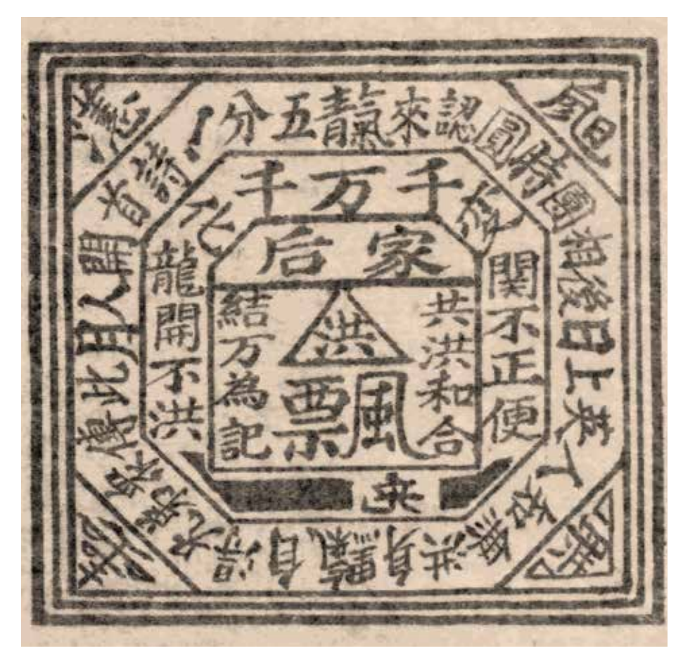
The chop or seal of the Ghi Hin (or Ghee Hin) secret society, which operated in the Chinatown area. All rights reserved, Vaughan, J. D. (1879). The Manners and Customs of the Chinese of the Straits Settlements. Singapore: Mission Press.

colonial rule in the 19th century.<sup>1</sup> And, as a first-hand account of early Singapore, the book's ethnographic data will likely interest students of the Overseas Chinese in Southeast Asia.<sup>2</sup>