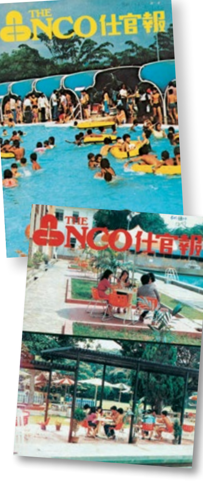
The NCO magazine. Top: May 1980, Vol. 5, No. 1. Above: Nov 1981, Vol. 6, No. 2.

Events like tombola nights, barbecue nights, excursions, picnics and cruises throughout the year were well patronised, and Christmas and New Year parties were always a highlight in the calendar. In December 1991 for instance, the New Year's Eve "Dance Night" only cost $25 per couple – for drinks, entertainment, a lucky draw and door gifts.