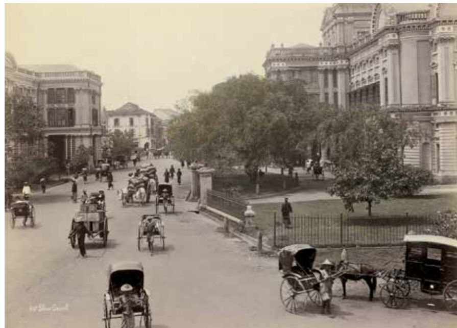
(Above) Before the advent of the automobile in Singapore in 1896, the common modes of transportation back then were the horse-drawn carriage, bullock cart and jinrickshaw, 1880s.