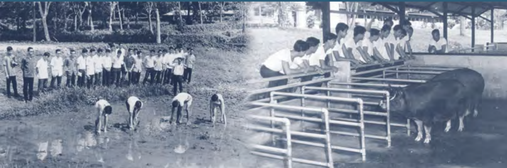
Practical sessions in progress at the Farm School, 1960s.