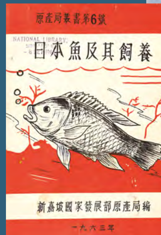
日本鱼及其饲养 Rearing of Japanese Fishes (1963)