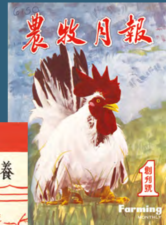
农牧月报 Farming Monthly (1962)

Here is a sampling of publications on farms and farming from the National Library's Legal Deposit Collection.