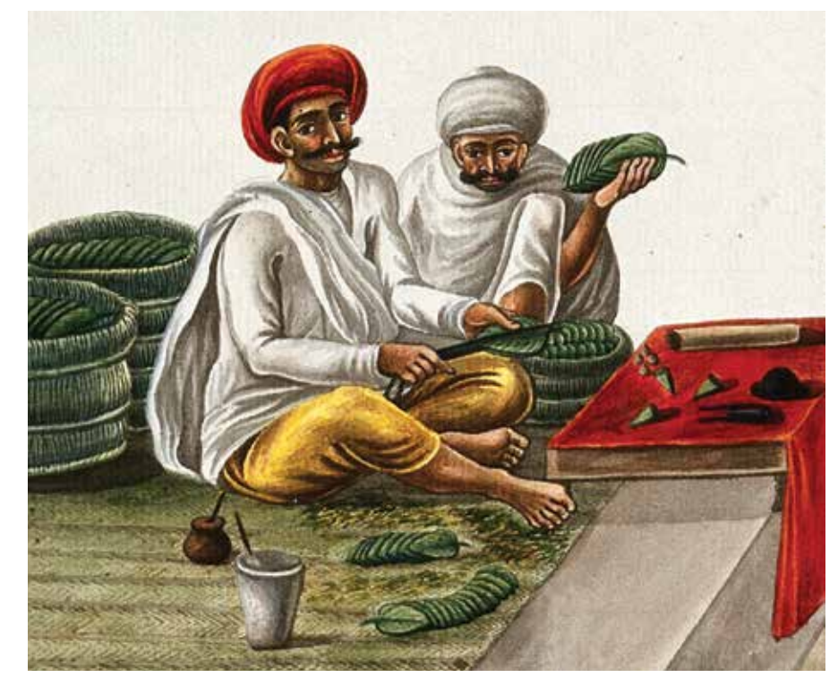
A painting of two men selling betel quid by an Indian artist, c. 1800s.

The World Health Organization (WHO) estimates that some 600 million people around the world consume some form of areca nut today. The areca nut is classified as a carcinogen by the WHO, and studies have shown a correlation between