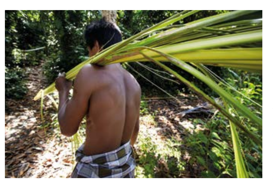
Janur (tender young coconut fronds), destined for transformation into ketupat casing, Photograph by Law Soo Phye, courtesy of Khir Johari

Kampong Wak Hassan and Pasir Panjang, for