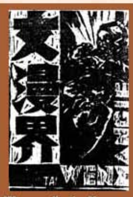
Weneven No, the Nenyang Slang Pao's art supplement first leaved in 1935 All rights reserved, Nayang Sang Pao, 1936

The practice of woodcuts (also known as woodblock prints), as an artistic medium, by our local artists could date back to the 1930s. As early as then, Chinese immigrant artists had held posts as teachers for the local Chinese schools and editors of the main Chinese dally newspapers like Nanyang Siang Pao (NYSP) and Sin Chew Jit Poh. Followed by the setting up of the Society of Chinese Artists in 1936 and the establishing of the Nanyang Academy of Fine Arts (NAFA) in