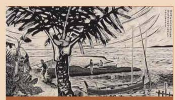
e Chie and Lim M lmage courtesy of artists