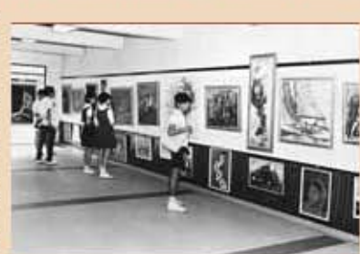
Students viewing local art displayed at the library's feyor in 1870

The National Library is not just a place for books: It has remained a loval supporter of the visual arts scene, even since its beginnings as the Raffles Library in the 1950s. Several local art activities and exhibitions, much like the woodcut show of 1966, were held at the library's Stamford Road building In