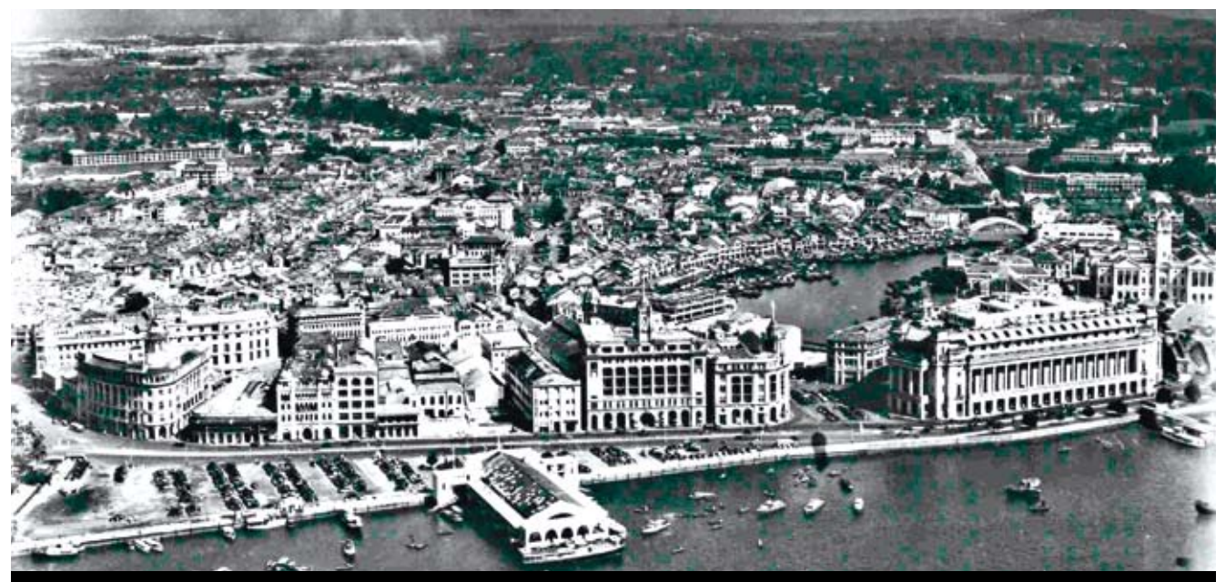
View of the waterfront buildings at the city centre which include Clifford Pier, Fullerton Building, Victoria Memorial Hall, Hongkong and Shanghai Bank, Union Building and Ocean Building