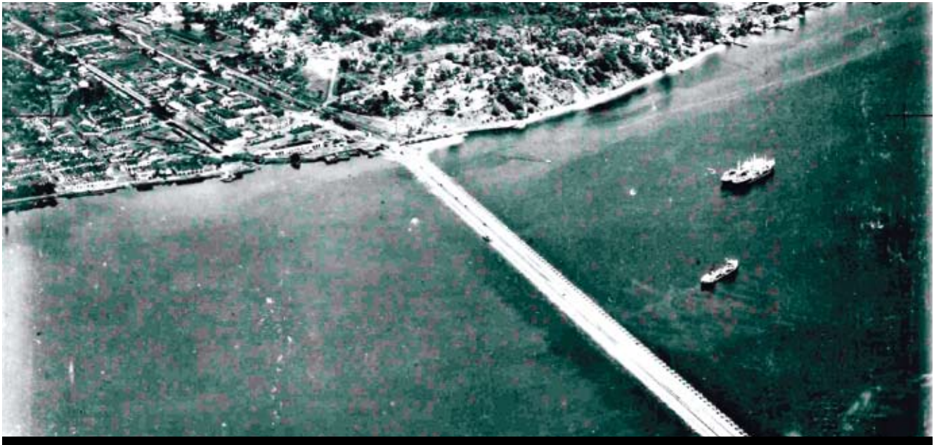
View of the Causeway facing Johore Bahru from Woodlands