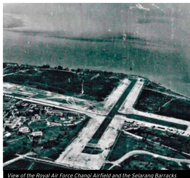
View of the Royal Air Force Changi Airfield and the Selarang Barracks

On the whole, the Williams-Hunt collection of Southeast Asian aerial photographs has been useful in researching into land utilisation in Southeast Asia, especially with the use of GIS technology. It has also proved useful for archaeological, anthropological and