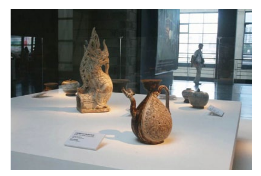
Southeast Asian ceramic masterpieces were exhibited on the large and low platform with the glass frames but not much protection in Taipei County Yingge Ceramic Museum, Taiwan