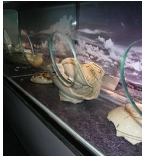
Southeast Asian ceramics "handle holes" in the Southeast Asian Ceramics Museum, Bangkok University Thailand